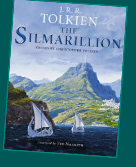
The Silmarillion Available in print, cl-ebook, Hoopla- ebook

The Lord of the Rings series Available in print, audio, clboth, Hoopla- both